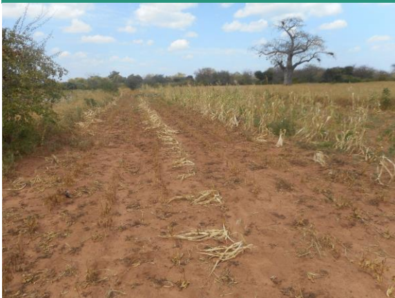
Crops in Kenya that should be ready for harvest have withered in the field due to a lack of rainfall.