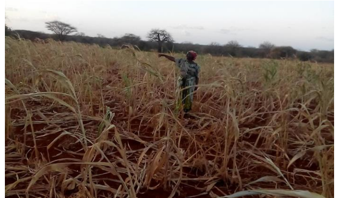
A woman standing in her field in Kenya. The maize crop has dried up as a result of the drought.

LWR has been working in East Africa since 1961 to help communities living in extreme poverty adapt to the challenges that threaten their livelihoods and well-being. LWR currently has projects in South Sudan, Tanzania, Kenya and Uganda and collaborates with local community-based organizations, church partners, and national and county government departments on programs to improve food security, livelihoods of communities, climate change adaptation and to respond to emergencies. With support from the United States Department of State Bureau of Population, Refugees and Migration (PRM), LWR and Lutheran World Federation/South Sudan are improving the protection, resilience and psychosocial well-being of children in refugee camps in Unity State and Upper Nile State, South Sudan.