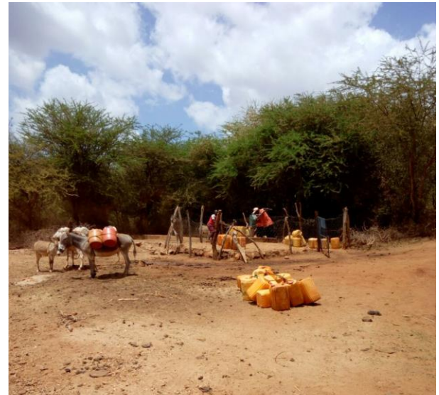
With the riverbeds completely dry, farmers in Kenya are having to work harder to find a water source. Pictured here, farmers dig deep into dry riverbeds, hoping to access at least a small amount of water.

For additional information about LWR's response to emergencies around the world, please visit lwr.org . You can also join the conversation about how LWR is assisting those affected and how you can help at facebook.com/LuthWorldRelief or twitter.com/LuthWorldRelief .