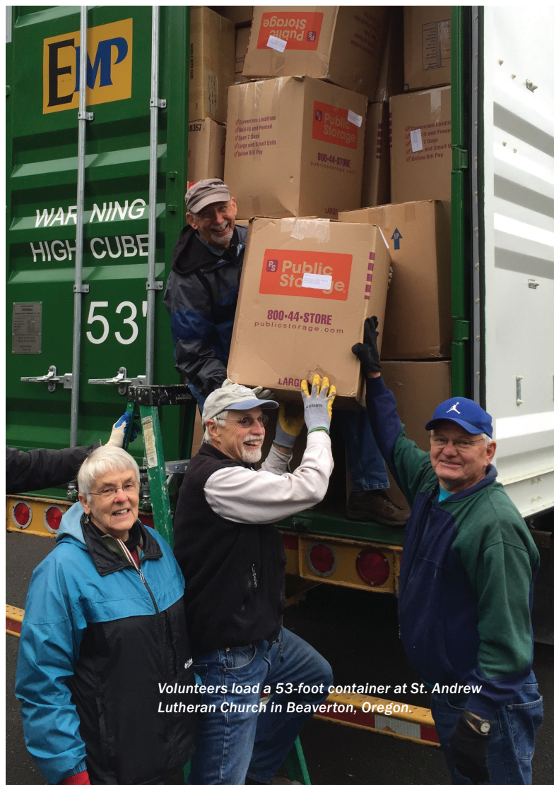
Volunteers load a 53-foot container at St. Andrew Lutheran Church in Beaverton, Oregon.