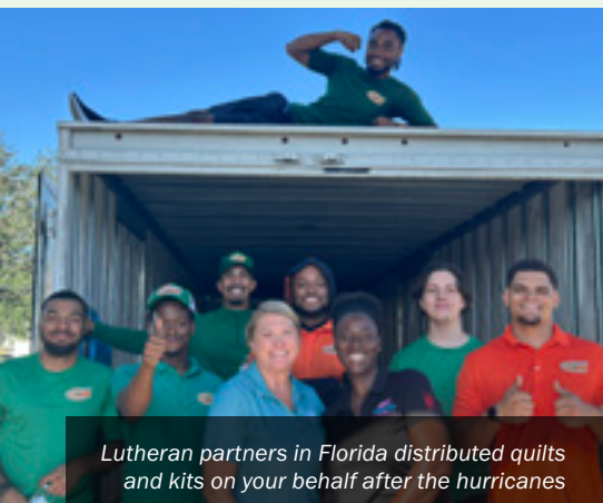
Lutheran partners in Florida distributed quilts and kits on your behalf after the hurricanes

Visit lwr.org/kitvideos to watch a video with tips and tricks for assembling Baby Care Kits!