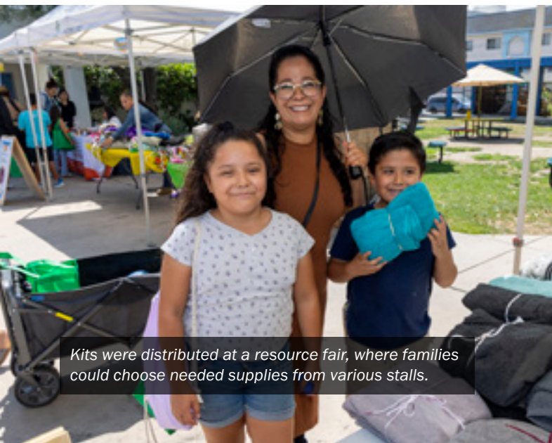
Kits were distributed at a resource fair, where families could choose needed supplies from various stalls.

In January 2025, wildfires ravaged southern California , destroying 18,000 homes. Your Personal Care Kits were a vital part of Lutheran World Relief's broader relief efforts. Other support included Quilts, School Kits, Fabric Kits, food, bottled water, clean up kits, clothing, gift cards for essential needs, and trauma counseling for people who were directly affected by this devastating disaster. Quilts and kits were distributed in partnership with the Los Angeles Regional Food Bank — which asked for LWR Personal Care Kits by name because they filled a critical need. ■