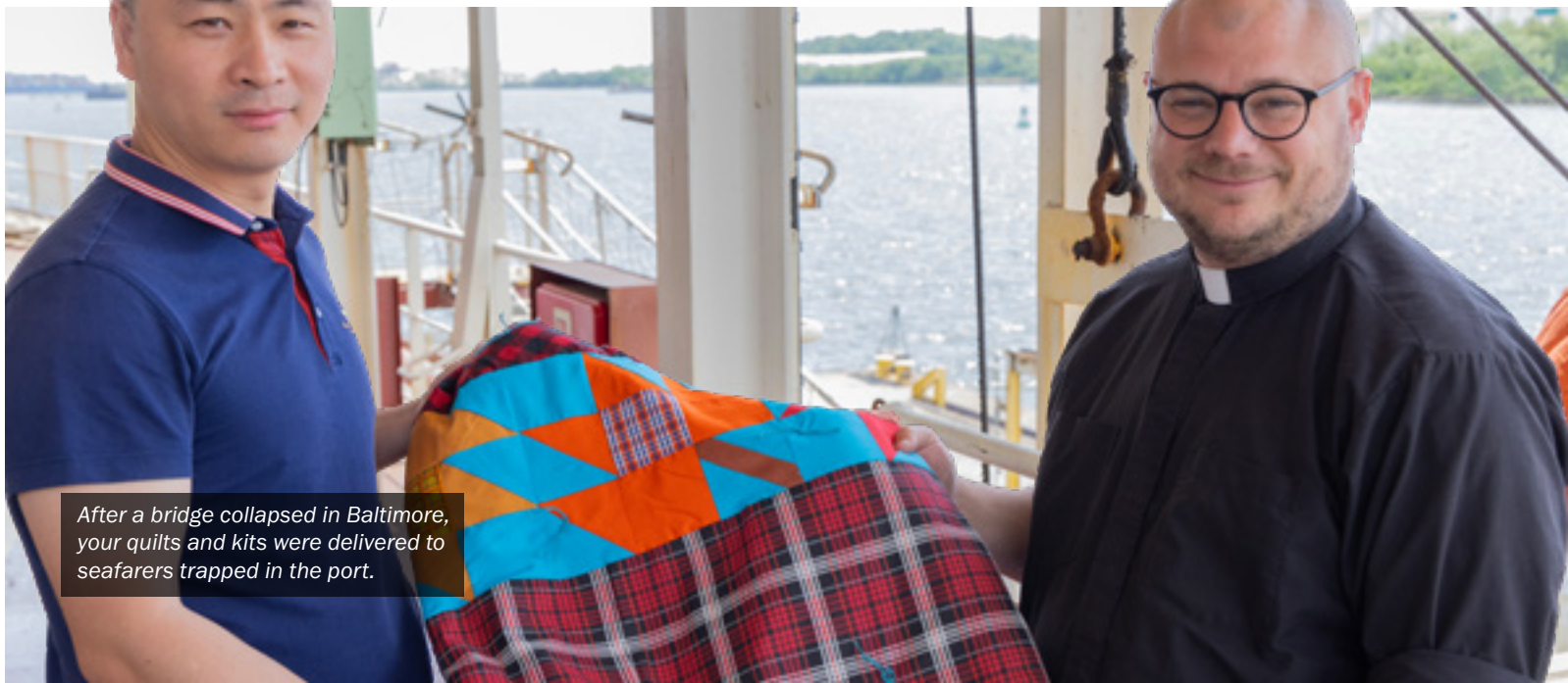
After a bridge collapsed in Baltimore, your quilts and kits were delivered to seafarers trapped in the port.