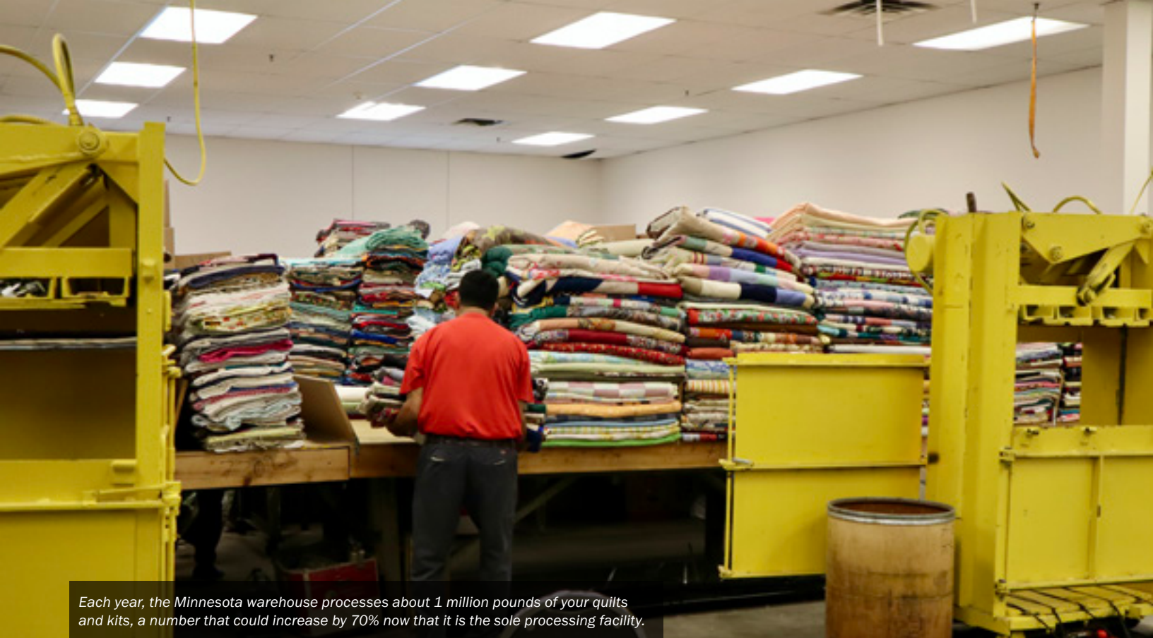
Each year, the Minnesota warehouse processes about 1 million pounds of your quilts and kits, a number that could increase by 70% now that it is the sole processing facility.