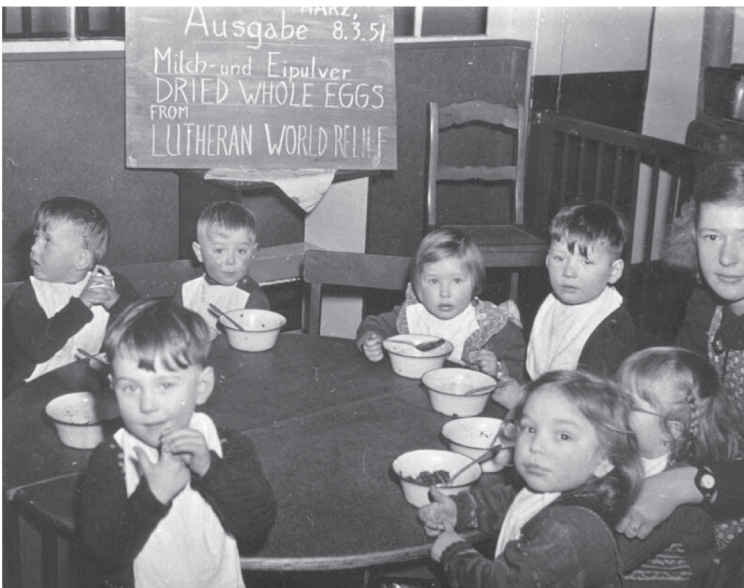
Lutheran World Relief feeds refugee children in Germany, 1940s

Thank you for your support and commitment to this loving legacy of helping God's children in need — no matter how far or how long it takes.○