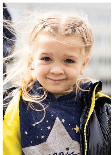
Helping God's children in Ukraine find shelter, food and hope in wartime, 2022-Present