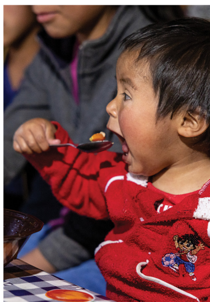
Feeding hungry children in Guatemala with sustainable solutions, 2021