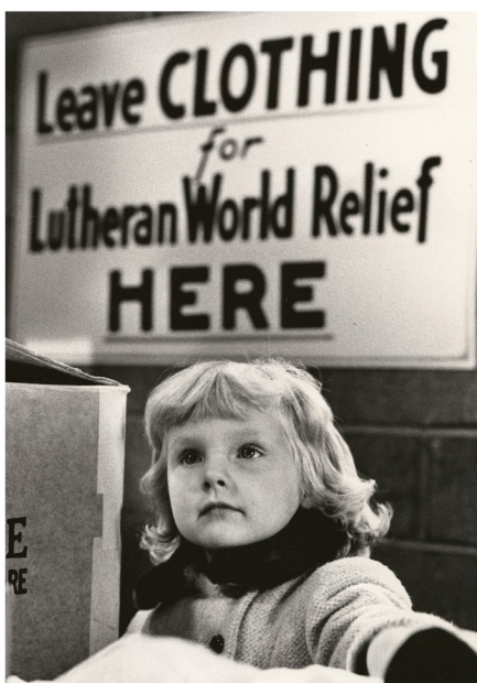
Collecting clothes for neighbors in need, 1958