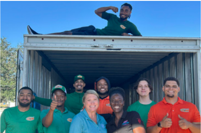
Above: Lutheran partners in Florida ready to distribute LWR Quilts & Kits for neighbors whose homes were damaged or destroyed.