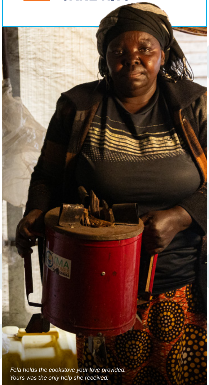
Fela holds the cookstove your love provided. Yours was the only help she received.