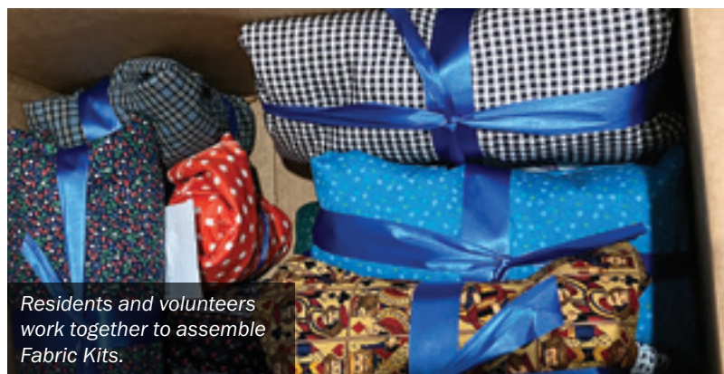
Residents and volunteers work together to assemble Fabric Kits.

"It's a great opportunity to show others we are never too old to serve," Barbara says. ■