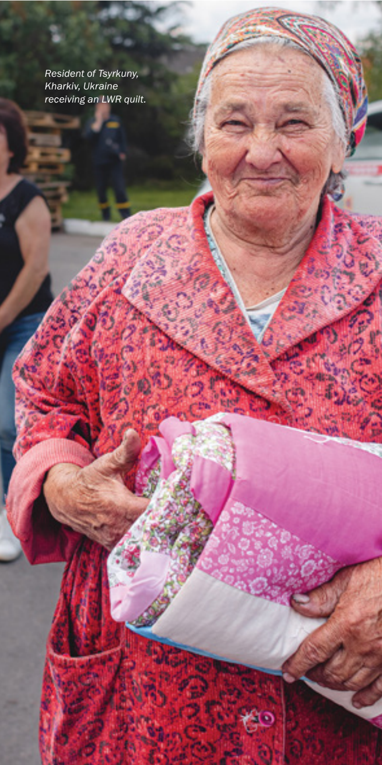
Resident of Tsyркuny, Kharkiv, Ukraine receiving an LWR quilt.

LEADER: God, you call us to love our neighbors as ourselves. Send forth your Spirit today as we call upon you to bless our work and make it holy. Help these quilts and kits, our offerings of hope, travel across the farthest distances to reach our most weary neighbors and surround them with your grace and peace.