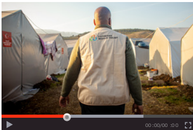
UNTIL YOUR LOVE REACHES EVERY NEIGHBOR

View the videos below and other helpful resources today at lwr.org/mission .