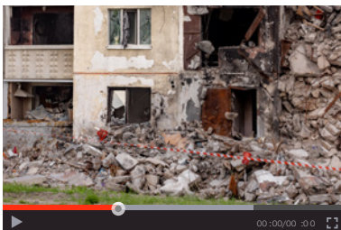
FAITH ON THE FRONTLINES