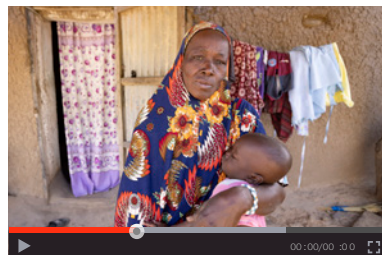
FAITHFUL CARE FOR A HUNGRY WORLD