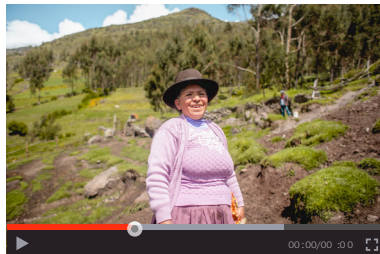
NO MATTER HOW FAR