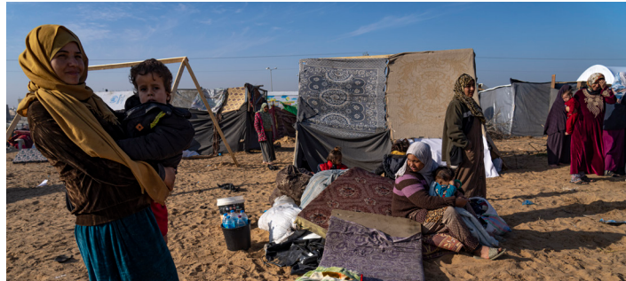
ABOVE: Families in Gaza displaced by the ongoing war.

In UKRAINE , you are contributing to the largest humanitarian effort in our history by supporting mobile medical units that are reaching people living in communities with no access to health care because of the war. In the first two months of operation, some 5,000 people were reached by these clinics on wheels and more than 15,000 medical services were provided.