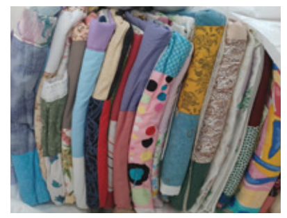
Quilts ready for distribution at a warehouse in Ukraine.

Your support of the Quilt & Kit Shipping Fund is an immense help and ensures your quilts and kits get to those who need them as quickly as possible during a crisis.