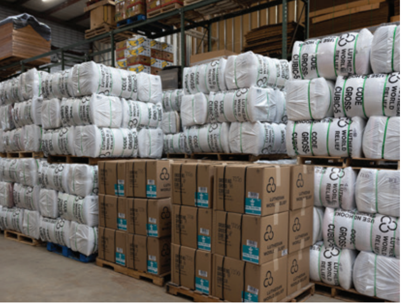
Bundles of quilts and boxes of kits in the warehouse in New Windsor, Maryland, ready for shipment to Türkiye.